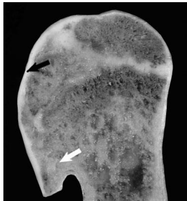
Figure 1. Proximal humerus image of 1-year-old Qianbei-Pockmarked goat with phosphorus deficiency, showing a flattening of the humeral head and separation of articular cartilage from collapsed subchondral bone (black arrow). Also shown is segmental thickening of the physis (white arrow), thickened metaphyseal trabeculae, and thickened cortices.

Disease mainly occurred in lambs and mature ewes throughout the year, with a peak incidence between July and October. Post-partum and pregnant ewes were most commonly affected by the disorder. Clinical symptoms were less obvious in mature males. In severe areas, 28.33% of Qianbei-Pockmarked goats were affected and mortality reached 47.14%. Aside from the symptoms described above, the long bones of affected Qianbei-Pockmarked goats were frequently broken without apparent stress. However, the respiratory rates, body temperatures, and heart rates of affected animals were healthy (Table 1).