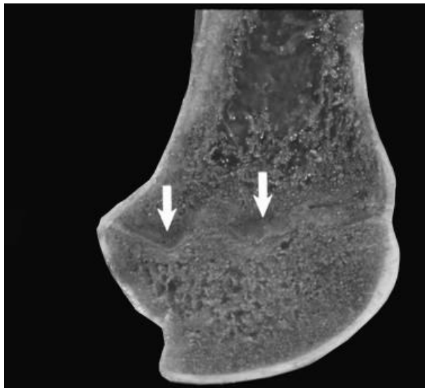
Figure 2. Distal femur from a 1-year-old Qianbei-Pockmarked goat with phosphorus deficiency. White arrows indicate segmental physal thickening.

provisional calcification of cartilage at sites of endochondral ossification led to the accumulation of hypertrophic chondrocytes, resulting in thickened and irregular growth plates with islands and tongues of chondrocytes extending into the metaphyses (Figure 3). The enlargement of joints with an apparent bowing of the long bones and a broadening of the epiphyses were also typical. Irregular ulcers were also observed on the surface of joints in affected Qianbei-Pockmarked goats (Figure 4). Lesions were most severe in the fastest-growing bones, including the radius, tibia, metacarpals, and metatarsals. Radiographic analyses revealed that widening of the