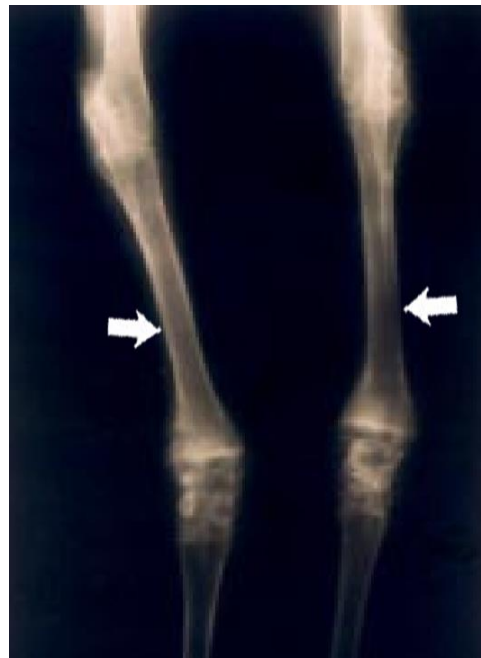
Figure 4. Radiographic view of the forelegs of a 1-year-old Qianbei-Pockmarked goat with phosphorus deficiency. The medullary canals were wide and the cortex was thin in the long bones of the forelegs (White arrows).

physal growth plates was the most archetypal change. Other abnormalities observed upon radiographic analysis included metaphyseal flaring, thinning of the cortex, poor mineralization of the skeleton, and pathological fractures (Figure 4). Similar changes occurred beneath the articular epiphyseal cartilage complexes in the expanding epiphyses of young goats. Other microscopic changes included the development of thick osteoid seams lining trabeculae and the disorganization or absence of the primary spongiosa. Hemorrhage and signs of trauma were observed in the metaphyses and primary spongiosa due to damage to the weakened trabeculae of poorly mineralized bone.