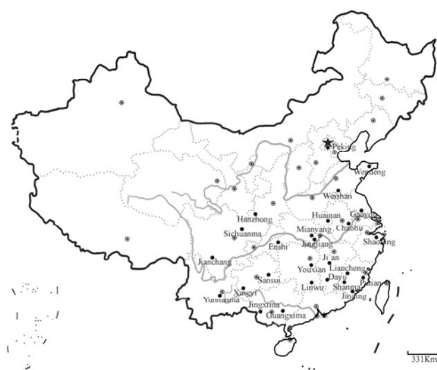
Figure 1. Sample locations of the 26 breeds of Chinese indigenous duck from China.

population size variations in the duck populations. Many microsatellite markers were developed for ducks (Buchholz et al., 1998; Maak et al., 2000; Stai and Hughes, 2003), but the number and polymorphism of these markers were limited. We have previously identified over 100 duck microsatellite markers, which can be used to analyze the